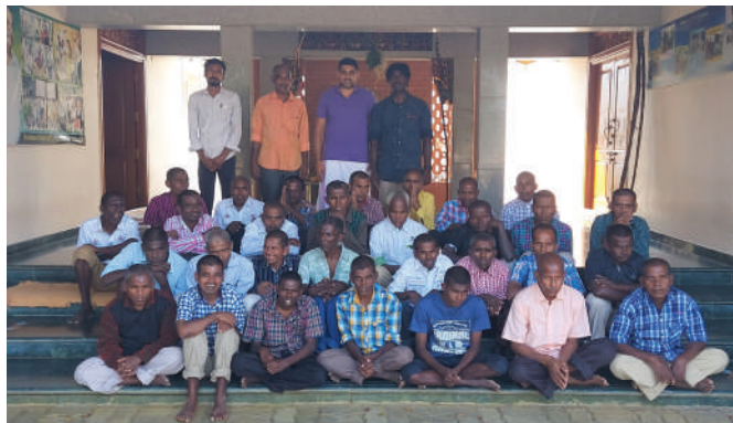
Shanthivanam Home Chennai Pongal Celebration