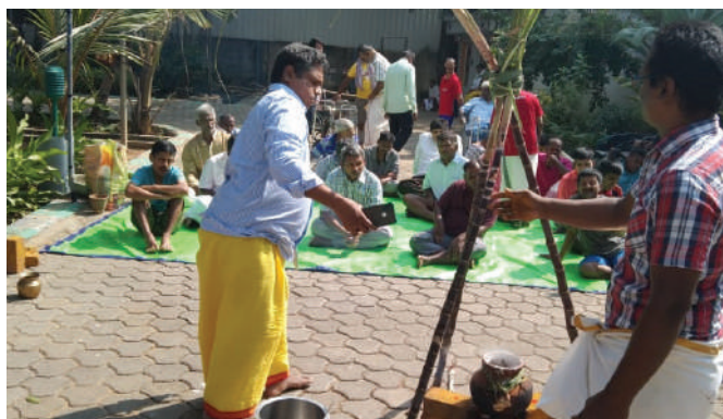
Pongal Celebrated at RVN School Chennai