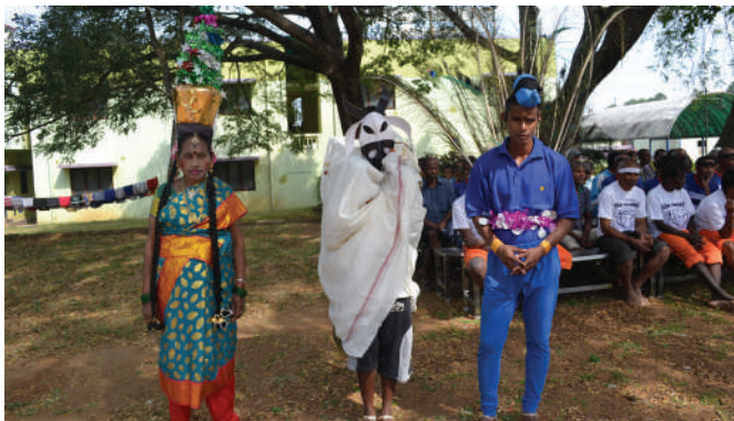
Residents of Thanjam & Shakthivanam wearing Traditional attire