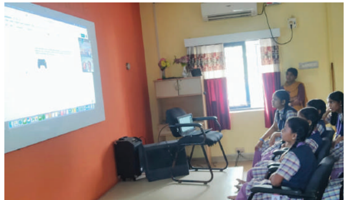
Resident Children attending on line classes