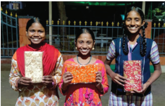
Resident girls displaying their rewards