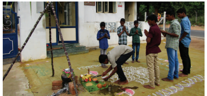
Sondham Home celebrating pongal festival